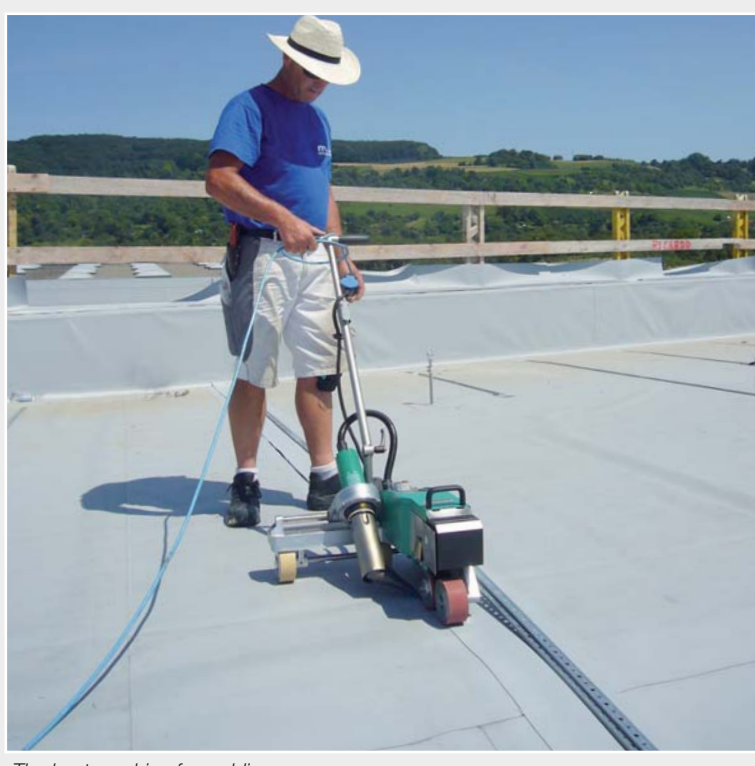
The best machine for welding seams.