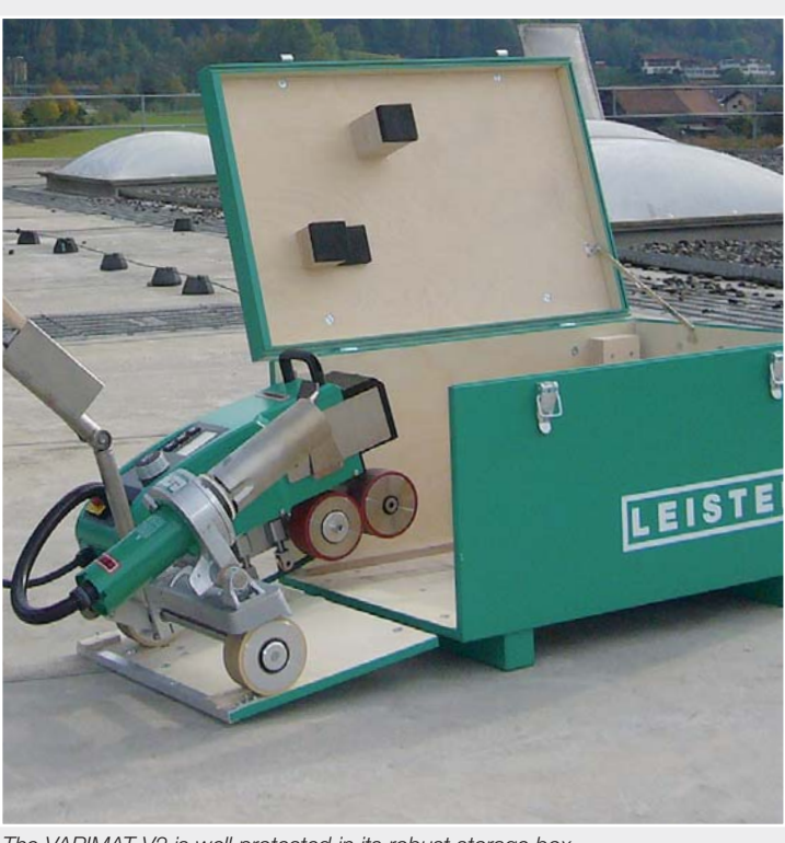
The VARIMAT V2 is well protected in its robust storage box. It can easily be removed and replaced quickly.